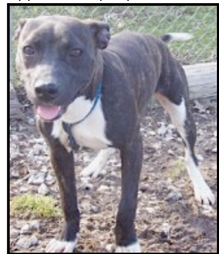
Hershey enjoys the sun but wonders where her recently adopted playmate has gone.

The Oasis staff celebrates every adoption, but when Roxie found a new home last year, the volunteers were ecstatic. The middle-aged girl with such a wonderful disposition had been waiting a long time. The match seemed perfect, and it was. Sadly, Roxie was returned to the shelter recently when her “mom,” developed serious health problems and could no longer care for her. Roxie has handled her return with amazing grace. On any given morning she can be seen running around the yard, jumping and playing with dogs years younger, but she deserves another good home. Hershey also came back to the shelter when her mom could no longer care for her. Like Roxie, the friendly American Staffordshire Terrier had been a great family member and was the victim of bad luck. Hershey misses her home a great deal. She is happiest with people.