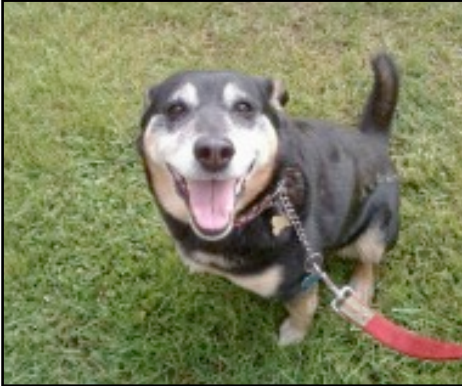
Roxie, a graduate of an obedience training program, sits on command during a walk, then smiles for the camera.