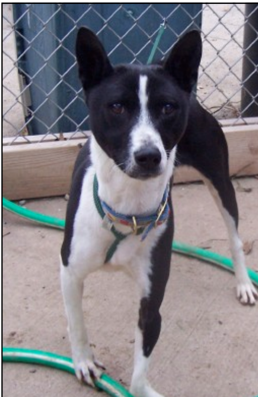
Iggy was found wandering the streets, a terrifying situation for the little Basenji, who is blind and has a deformed leg. Iggy runs and enjoys walks like other dogs, but he really needs to be in a loving home rather than a shelter.