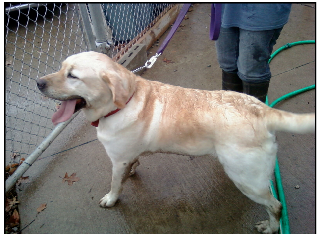
Baron , a big, strong, affectionate lab, loves to be with people. He responds well on walks, as if he's had some lead training.