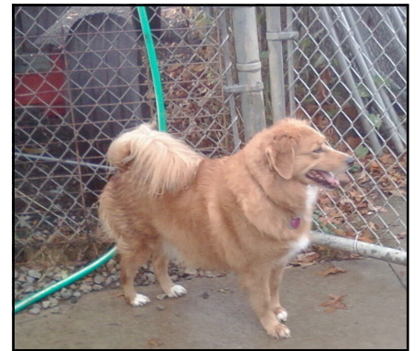
At right, Emma stands near the shelter gate, waiting to go home.