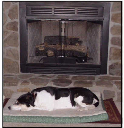
This picture is truly worth a thousand words.