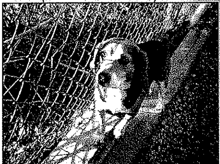
Woody demonstrates his balancing act. This youngster has a wonderful disposition. (Who doesn't love a beagle!?)