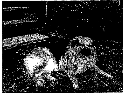
Fluffy relaxes in the yard of her happy home.