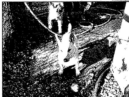
If Rocko could talk, he would say, "You throw; I'll fetch" over and over. (Jack Russell mix)