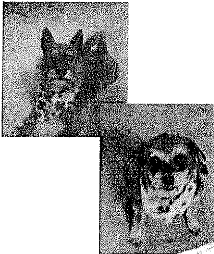
Tiny (left) and Ali (right) model their St. Patrick's Day scarves. (PS - Tiny is the ball player.)